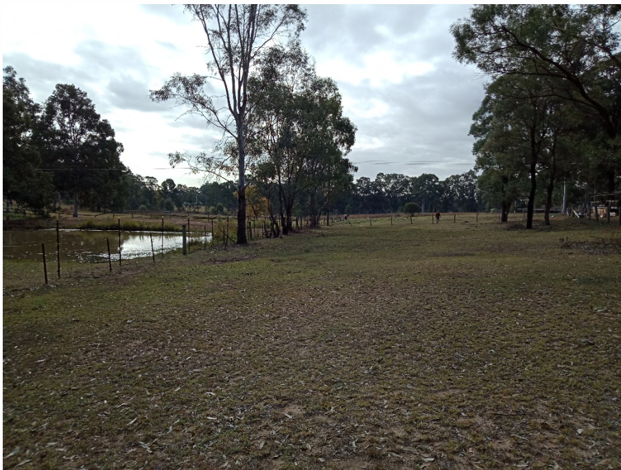
Plate 2 Study area was thinly covered in grass, view north.