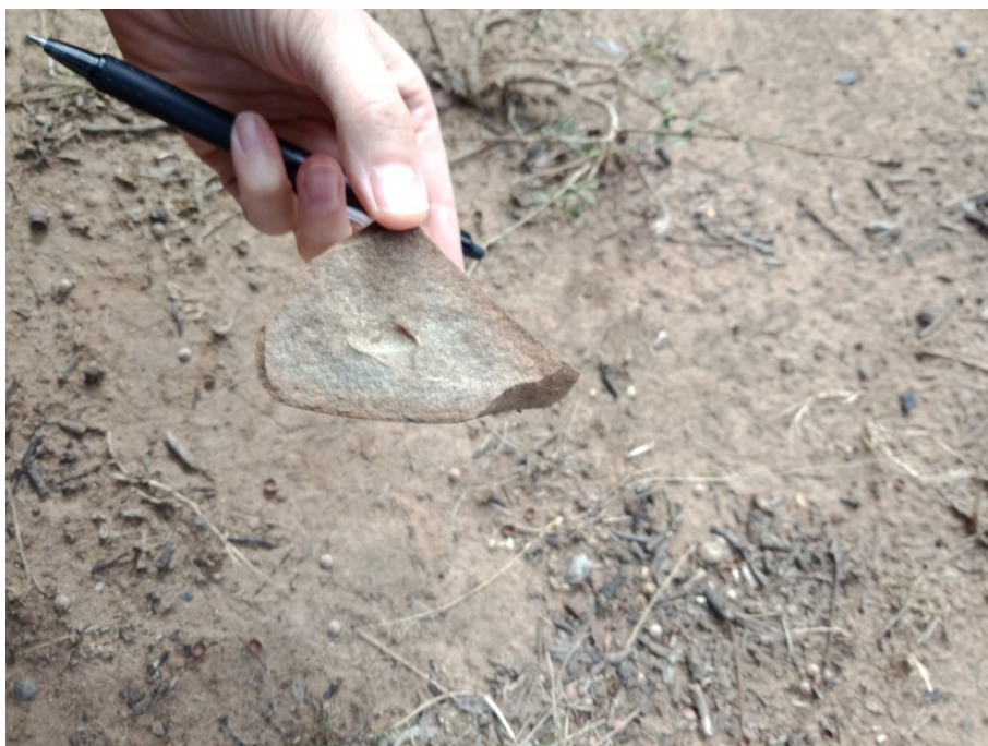
Plate 4 Silcrete cobble broken – but has not been worked and therefore is not classed as an Aboriginal object under the National Parks and Wildlife Act 1974.