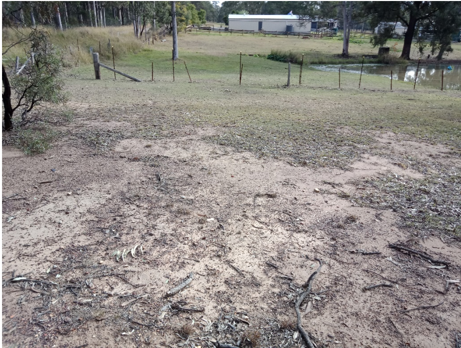
Plate 1 View west towards first order drainage line which has been dammed, dam in top right of photo. The dam is on the neighbouring property the boundary of the Study Area is demarcated by the fence.