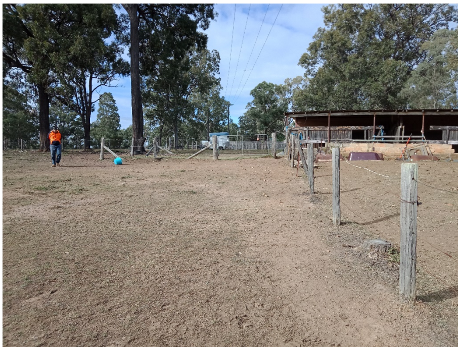
Plate 3 Exposure near stables, view to east.